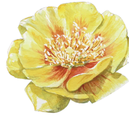
PRICKLY PEAR FLOWER